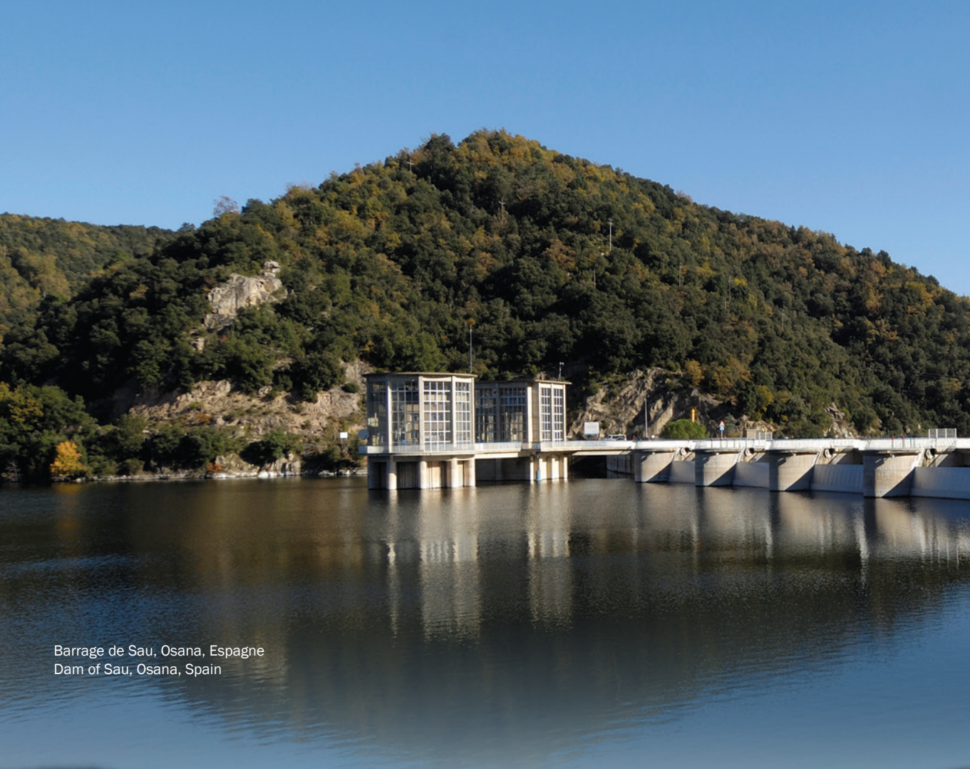
Barrage de Sau, Osana, Espagne Dam of Sau, Osana, Spain