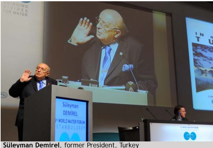
Süleyman Demirel, former President, Turkey

cooperative mechanisms and legal regimes for transboundary waters; the role of science and technology; and the need to consider the MDGs and the goals of the International Decade for Water in the regional process. A proposal to name 2012 the International Year for Water Diplomacy was discussed.