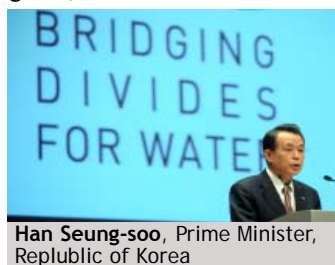
Han Seung-soo, Prime Minister, Republic of Korea

Initiating the session, WWC President Loïc Fauchon outlined “urgent imperatives” needed to realize the Hyogo Framework for Action 2005-2015, including incorporating disaster risk reduction and climate change adaptation in development planning. Han Seung-soo, Prime Minister of the Republic of Korea, highlighted strategies to increase global resilience, including sharing hydrological data and creating appropriate legal and policy frameworks. UN Under-Secretary-General Sha Zukang lauded the efforts of UN agencies in assisting vulnerable countries to create and implement national disaster plans.