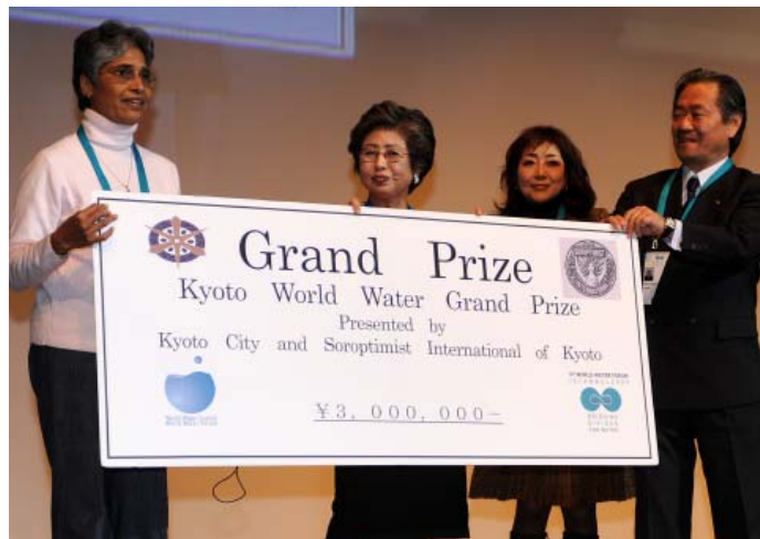
Winner of the Kyoto World Water Grand Prize