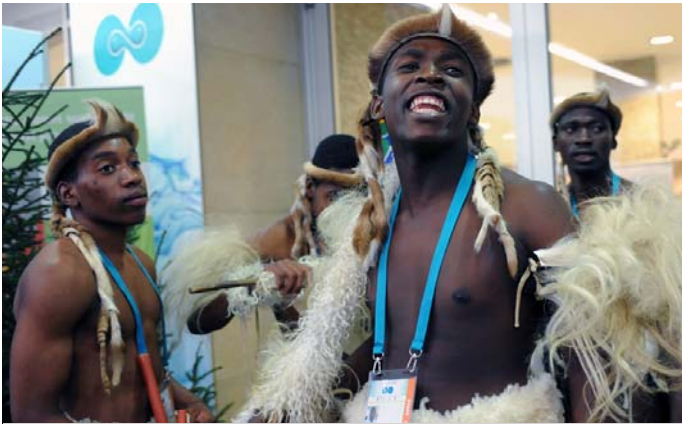
South African dancers performed at the Forum