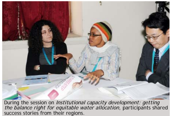
During the session on Institutional capacity development: getting the balance right for equitable water allocation , participants shared success stories from their regions.

The road less travelled (no more)?: Participants discussed the need to build bridges among professional associations, the development community and civil society organizations. They noted that broad consensus had emerged that professional associations are critical stakeholders in delivering results and sustaining projects on the ground, and their role was