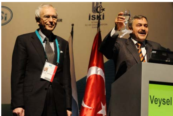
L-R: Oktay Tabasaran, Secretary General, World Water Forum, and Veysel Eroglu, Minister for Environment and Forestry, Turkey, who shared a Turkish proverb with participants.