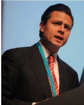
State of Mexico Governor Enrique Peña Nieto

During the opening session, sub-regional representatives reported on key outcomes of their consultative processes.