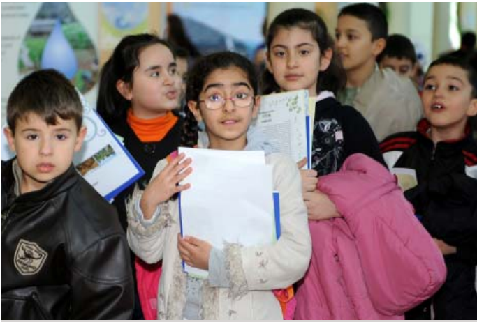
Children at the Forum

advance dialogue on the right to water and sanitation. Some argued that legal entitlements are necessary for accessing the benefits of a right to water and sanitation.