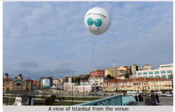
A view of Istanbul from the venue

In response to these challenges, the World Water Forum was initiated as a platform to include water issues on the international agenda. This Forum is convened every three years by the World Water Council (WWC) and a host country. The WWC, an international policy think-tank established in 1996, addresses global concerns over the pressures on the Earth's freshwater resources. The Forum is an open, all-inclusive,