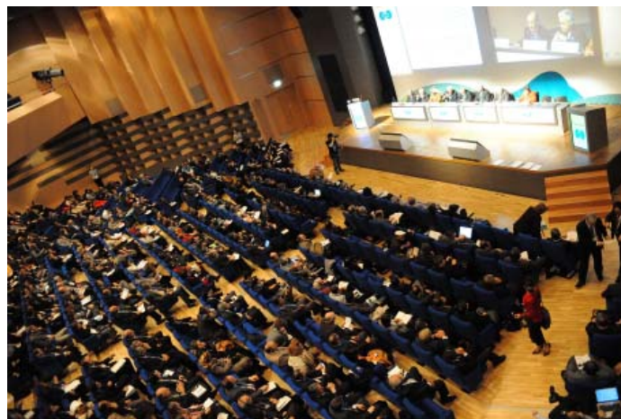
A bird's eye view of the Dialogue between Local Authorities and Parliamentarians session

Following separate meetings, parliamentarians and representatives from local authorities convened on Thursday for a joint dialogue on decentralization and a right to water and