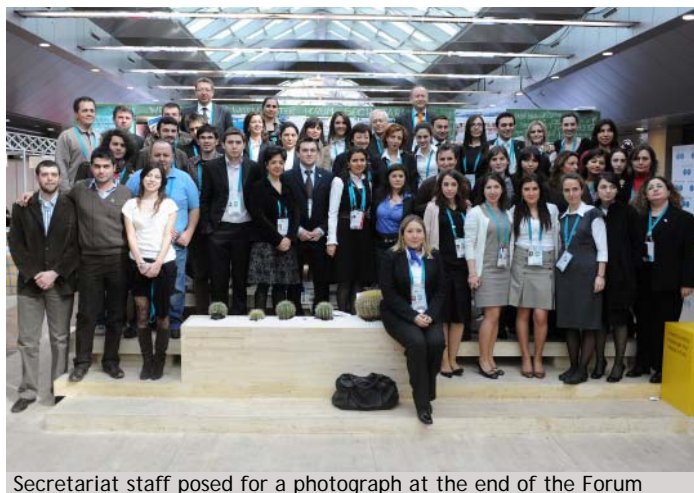
Secretariat staff posed for a photograph at the end of the Forum