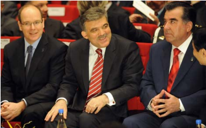
L-R: Albert II, Prince of Monaco; Abdullah Gül, President of the Republic of Turkey; and Emomali Rakhmon, President of Tajikistan

individuals and institutions; increasing adaptive capacity through disaster risk reduction; and recognizing the importance of cooperative transboundary water management.