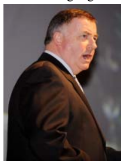
Loïc Fauchon, WWC President

Loïc Fauchon, World Water Council (WWC) President, stressed the urgency of ensuring access to water. He highlighted the role of political will in enabling