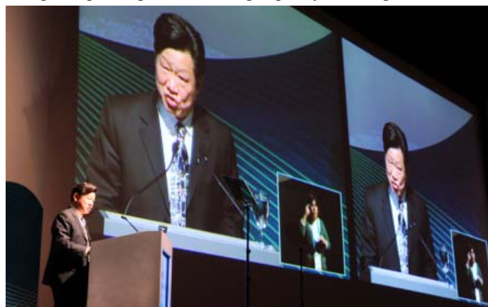
UN Undersecretary-General Sha Zukang

UN Under-Secretary-General Sha Zukang, in a statement on behalf of UN Secretary-General Ban Ki-moon, described the value of the Forum in facilitating dialogue between civil society and the policy community. He suggested focusing on four areas of strategic action: linking water and climate change; improving and financing capacity-building for