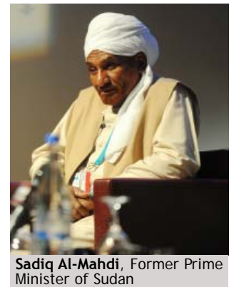
Sadiq Al-Mahdi, Former Prime Minister of Sudan

In a closing panel discussion, panelists from academia, policy institutions, government and civil society discussed, inter alia : exploring innovations outside the water sector; disseminating good practices; strengthening education and research collaboration; promoting IWRM approaches; and accelerating ratification of international treaties to address water-based conflicts.