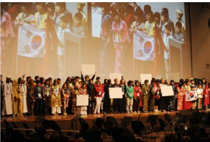
Children hold up messages to participants of the opening ceremony.