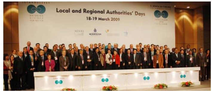
Participants of the Local Authorities session posed for a photograph

LOCAL AUTHORITIES’ DIALOGUE: Some 91 local authorities and 200 mayors met on Wednesday and Thursday afternoon to discuss the Istanbul Water Consensus (IWC). On Thursday a panel focused on: the responsibilities of local authorities; the need to mobilize financial resources for water and sanitation; the impacts of climate change; and disaster planning and management. Participants emphasized their key