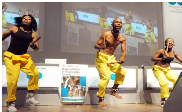
South African dancers performed during the Africa Regional Day

ASIA-PACIFIC: On Friday, Ravi Narayanan, Vice-Chair, Asia-Pacific Water Forum (APWF) Governing Council, launched the Regional Document, saying it addresses, inter alia : water financing and capacity development; water-related disaster management; monitoring of investments and results;