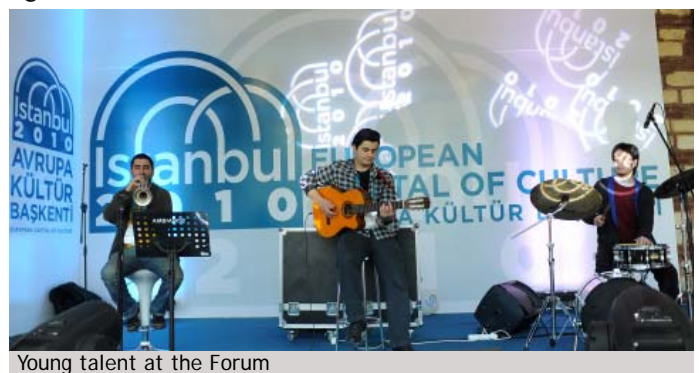
Young talent at the Forum